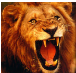
Disciplining a dynamic child can sometimes seem like taming a lion!

Understand that the way to win this child over is first and foremost recognize his God-given leadership ability.